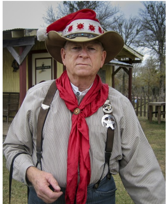
Santa Lincoln Drifter