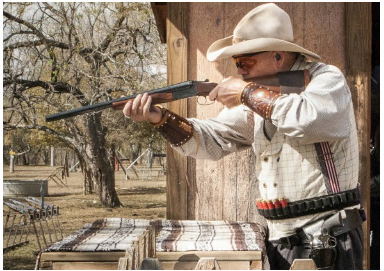
Texas Trinity Kid