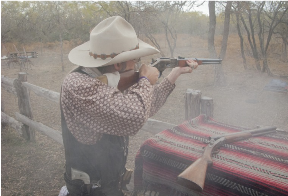
Abilene in a fog of holy black!