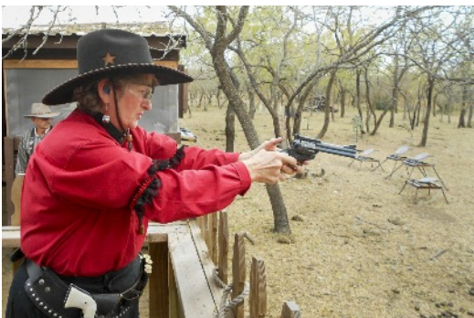
Tudelum Creek Granny