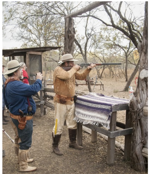
Texas Sarge, Artiman timing