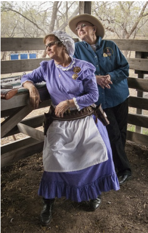
Boosey Babe & Texas Two-Step